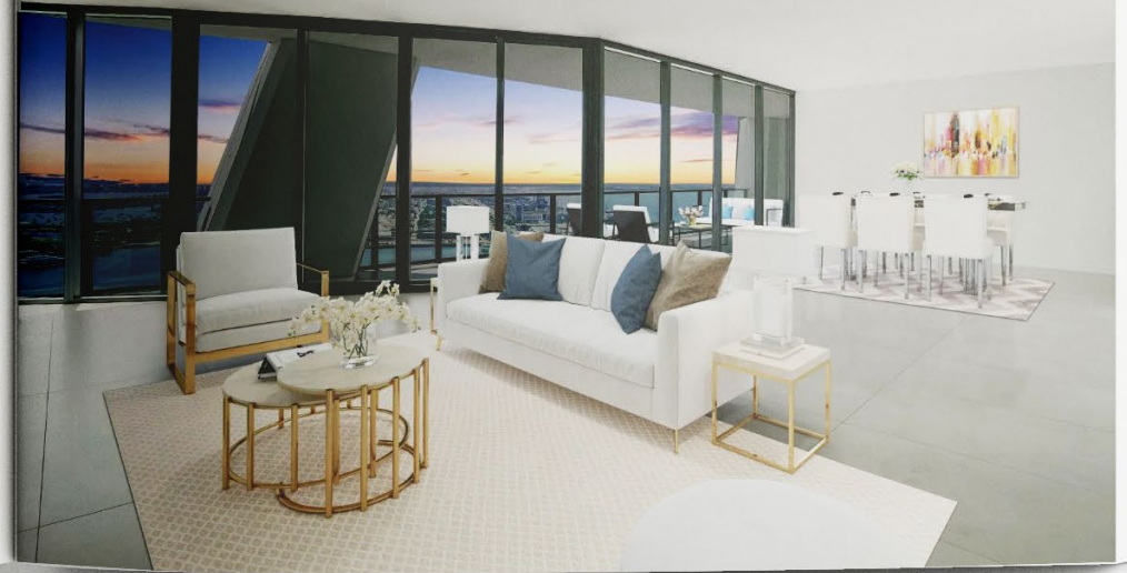
SAMPLE BOOK SPREAD