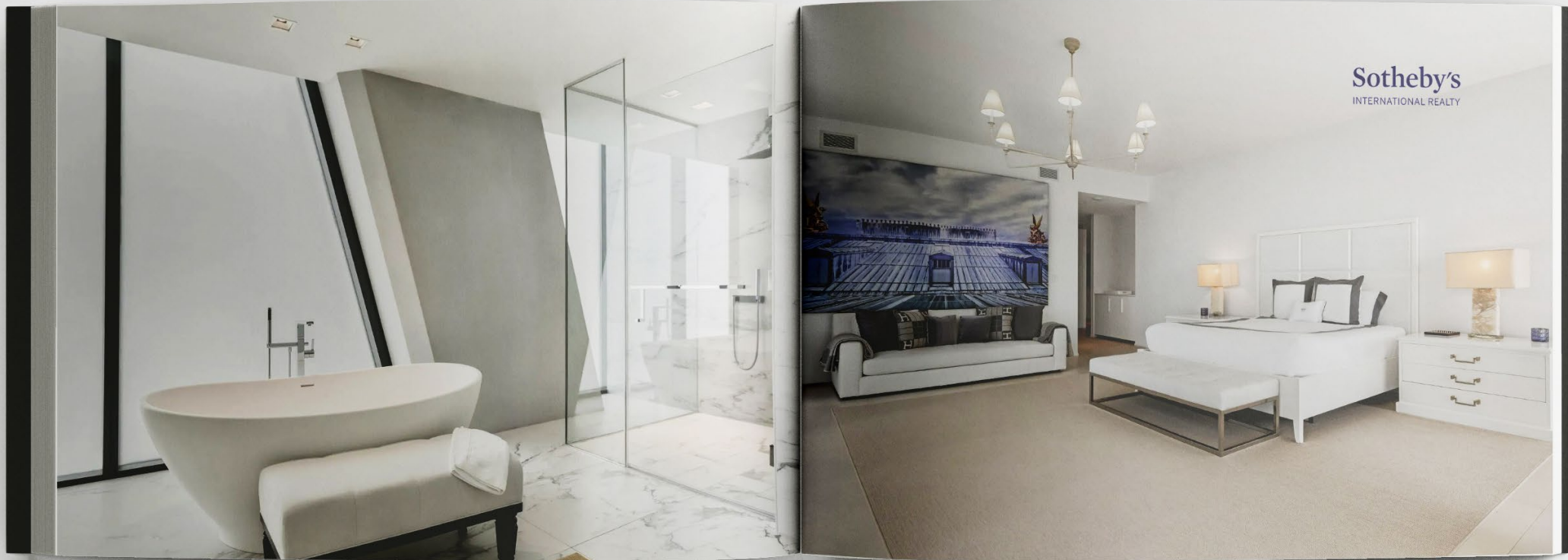
SAMPLE BOOK SPREAD